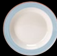
Soup Plate 0215 21.5cm (8 1 / 2 "")