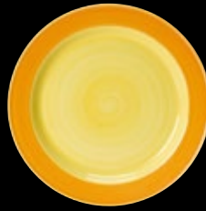
Plate Slimline 0211 23.0cm (9") NEW