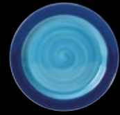
Plate Slimline 0214 15.75cm (6¼") NEW