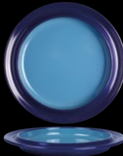
Freedom Plate EL677 25.0cm (10") NEW