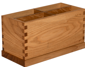
CUTLERY BOX 240X110X130/ 1,07 kg