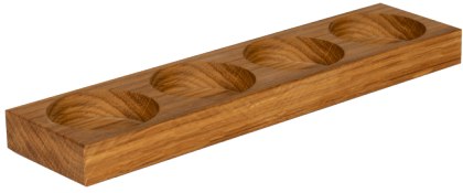
BOTTLE BOARD 360x90x30 mm/ 0,43 kg