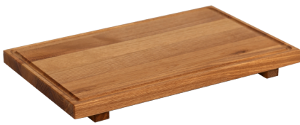
BOARD 340X220X35 mm/ 1,18 kg